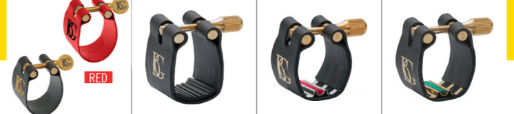
NO PLATE RUBBER PLATE SILVER PLATED PLATE 24K GOLD PLATED PLATE

HOMOGENEOUS IN ALL REGISTERS EASY TO ADJUST PRECISE ARTICULATION ENSEMBLE & CHAMBER MUSIC EASY TO PLAY STABLE INTONATION IN ALL REGISTERS ENSEMBLE WORK EASY STACCATO COMPACT SOUND THE SOLOIST'S LIGATURE EASY STACCATO