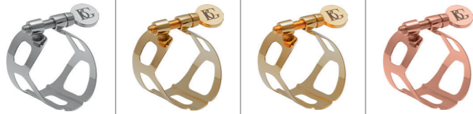
SILVER PLATED GOLD LACQUERED 24K GOLD PLATED ROSE GOLD

THE SOLOIST'S LIGATURE - DIRECT SOUND PROJECTION BRILLIANT SOUND