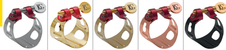
SILVER PLATED GOLD LACQUERED 24K GOLD PLATED ROSE GOLD BLACK LACQUERED

FOCUSED TONE - STABLE INTONATION IN ALL REGISTERS PRECISE ARTICULATION - GREAT PROJECTION